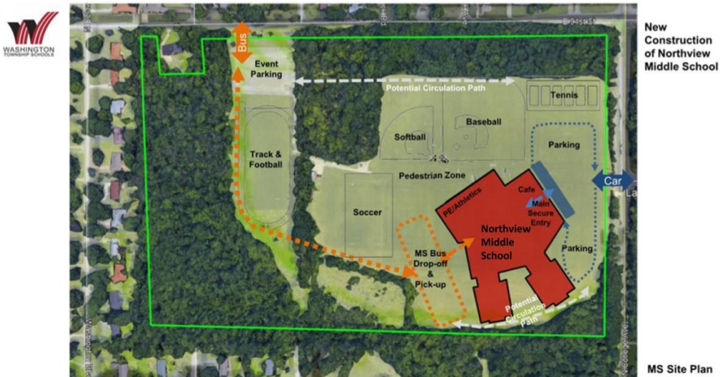
91st & College - DRAFT Plan 1/31/2020

Comprehensive details about both Construction and Operating Referenda can be found at: https://www.msdt.k12.in.us/future-planning/